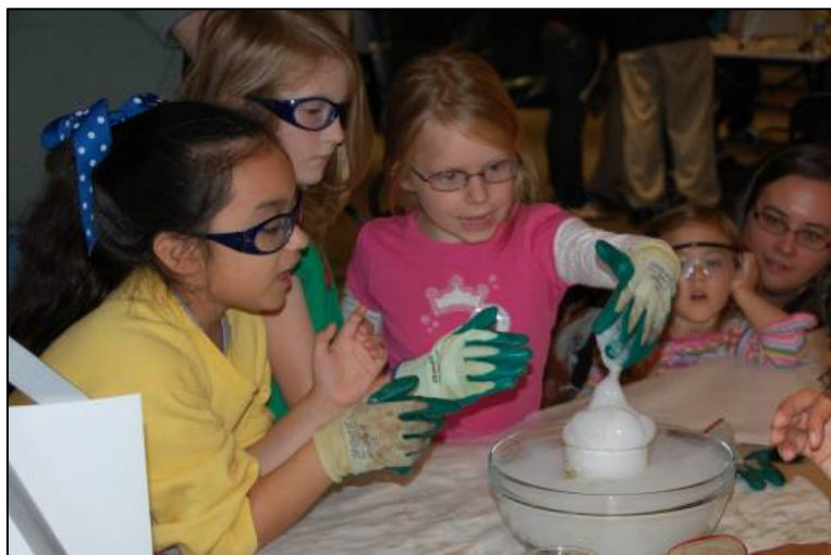
2011 Chemistry Day fun at KVM